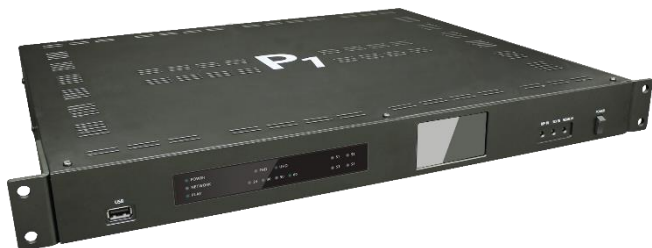
P1 4K player with SDI & HDMI output